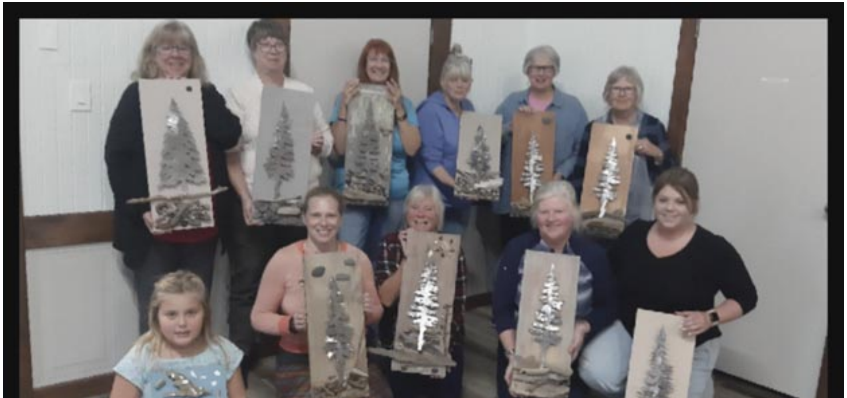
Crafts and friendship were created at the DIY metal tree class hosted by Pickled Pike Crafts.